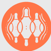
KAURNA WAYS OF T & L