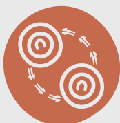
CO - TEACHING