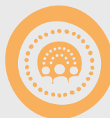
UNIVERSAL DESIGN FOR LEARNING